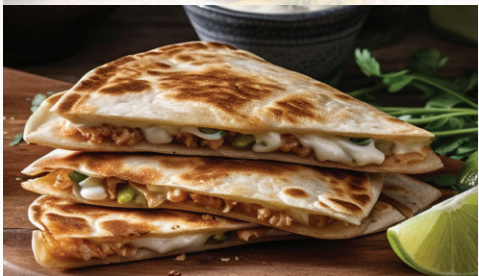
BBQ QUESADILLA $60 (SERVES 12-15) MOZZARELLA CHEESE, CARAMELIZED ONIONS, AVOCADO SAUCE, AIOLI, FRESH CILANTRO. CHOICE OF: BBQ GRILLED CHICKEN, BRISKET OR PULLED PORK.