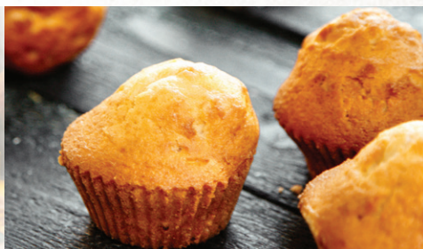
MINI CORNBREAD MUFFINS $12 (ONE DOZEN) GLAZED WITH HONEY AND BUTTER