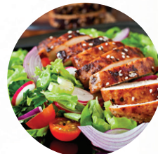
SANTA FE CHICKEN BBQ SALAD $40 / $80 ROMAINE LETTUCE, CORN, BLACK BEANS, TOMATOES, CUCUMBER, AVOCADO & BBQ CHICKEN TORTILLA CHIPS