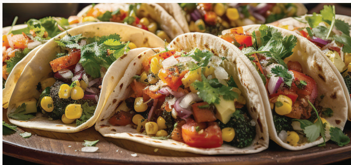
GRILLED VEGETABLE TACOS WITH ZUCCHINI, YELLOW SQUASH, BELL PEPPERS & BLACK BEANS