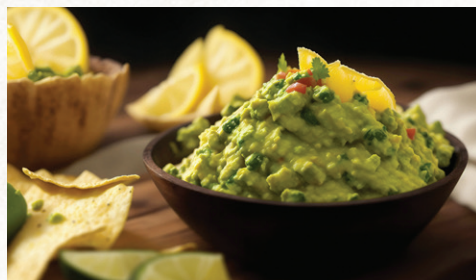
SMOKY GUACAMOLE $55 (SERVES 12-15) HOMEMADE TORTILLA CHIPS, CHARRED SALSA