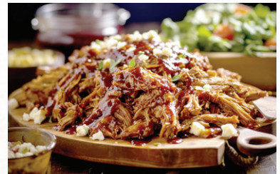
PULLED PORK SLOW SMOKED WITH OUR DRY SPICE RUB