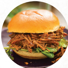
MINI PULLED PORK $48 RED CABBAGE, PICKLED ONIONS AND BBQ SAUCE