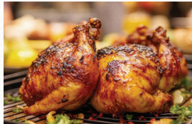
BBQ BRICK CHICKEN BRICK CHICKEN - BRUSHED WITH BBQ SAUCE