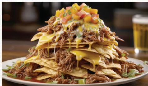
PULLED PORK NACHOS $60 (SERVES 12-15) FOUR CHEESE SAUCE, BBQ BAKED BEANS, SMOKED MOZZARELLA AND JACK CHEESE, WITH TOMATOS, RED ONIONS, SMOKED GUACAMOLE, PICKLED JALAPEÑOS, ORIGINAL BBQ SAUCE