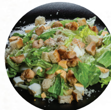
CAESAR $40 / $80 HEART ROMAINE LETTUCE, PARMESAN CHEESE, CROUTONS AND CESAR DRESSING