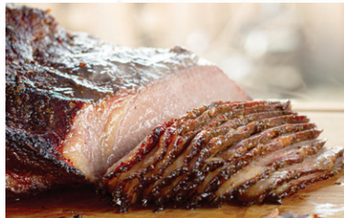
BEEF BRISKET DRY SPICE RUBBED AND SMOKED UP TO 12 HOURS