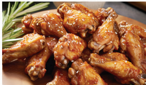
HOT WINGS $70 (SERVES 12-15) HOMEMADE BBQ SAUCE OR BUFFALO STYLE. SERVED WITH RANCH OR BLUE CHEESE