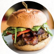
BURGER SLIDERS $45 BEEF SMOKED BACON, CHIPOTLE AIOLI, AGED CHEDDAR CHEESE, CARAMELIZED ONIONS

ALL SANDWICHES AND SLIDERS SERVED BY THE DOZEN