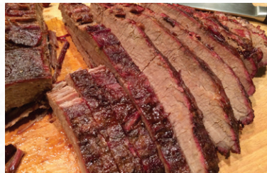
PEPPERCORN TRI-TIP BRUSHED WITH BBQ SAUCE