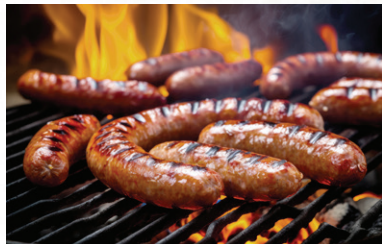
BBQ SMOKED SAUSAGE BRUSHED WITH BBQ SAUCE