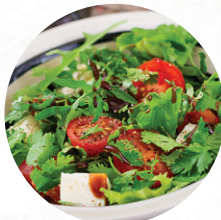
HOUSE GREEN SALAD $35 / $70 MIXED BABY GREENS, TOMATOES, WALNUTS, CUCUMBER, GRILLED APPLE, CARROTS, DRY CRANBERRIES AND RANCH DRESSING

SALADS SERVED WITH DRESSING ON THE SIDE • SMALL SERVES 10-12 • LARGE SERVES 20-25