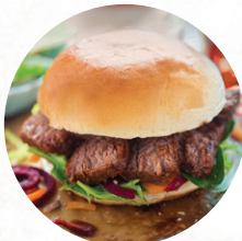
MINI TEXAS BEEF BRISKET $55 RED CABBAGE, PICKLED ONIONS AND BBQ SAUCE