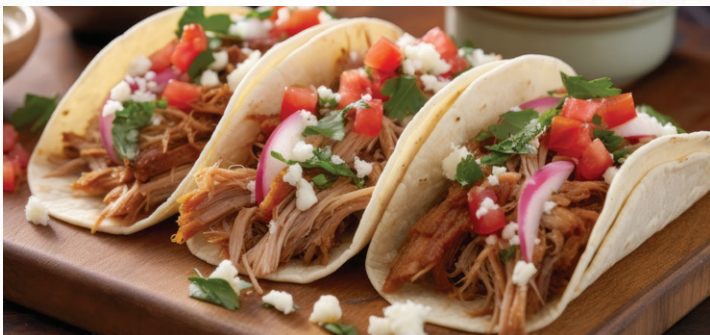
MESQUITE GRILLED CARNE ASADA TACO SERVED ON A HOMEMADE TORTILLA & TOPPED WITH PICO DE GALLO AND GUACAMOLE