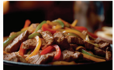
FAJITAS GRILLED RIB EYE STEAK, SERVED OVER SAUTÉED FRESH TOMATOES, ONIONS, ZUCCHINI, RED & GREEN PEPPERS WITH SPICES.

Signature Sides: Bbq Beans • Mac & Cheese • Mashed Potatoes • Collard Greens • Potato Salad • Potato Fries • Sweet Potato Fries • Chili Beans